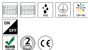
LEMUR 9W PRODUCT TABLE AND TECHNICAL SPECIFICATIONS - CRI→80